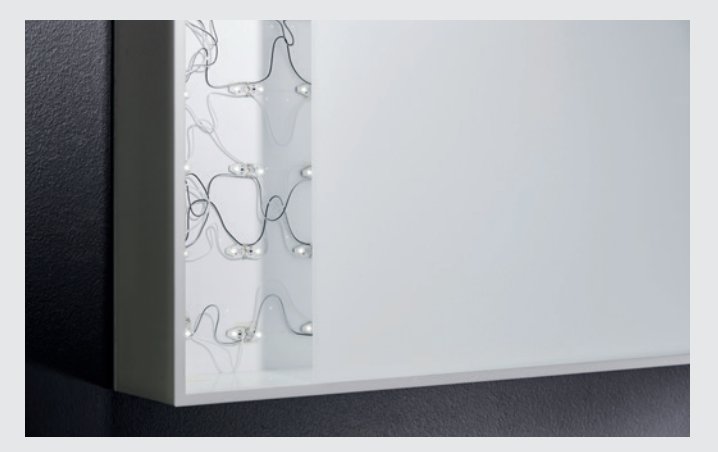
Fig. 1: Good light diffusion properties without visible hot spots from the LEDs % \left( {{\rm LED}} \right)