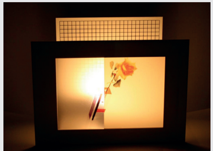
Illuminated background with PLEXIGLAS® film on the right, without film on the left.