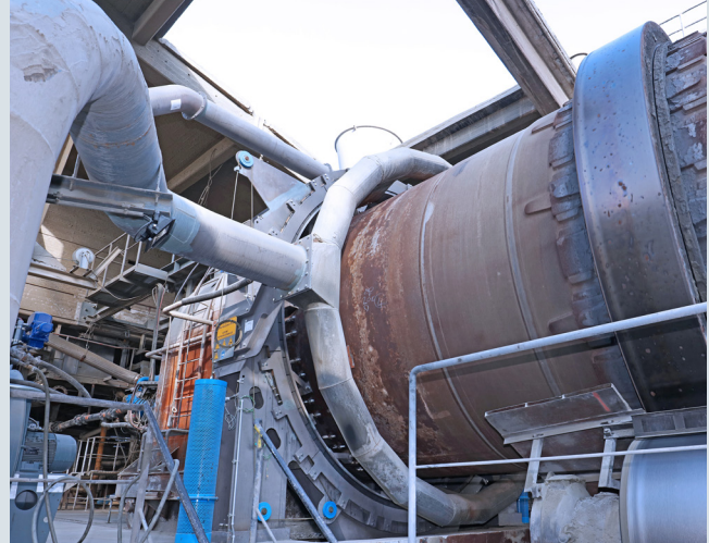
Graphite seal at a rotary kiln on the kiln outlet side.