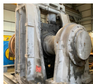
Full servicing of a roller unit