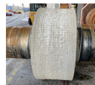
Refurbishment of an HPGR roll body