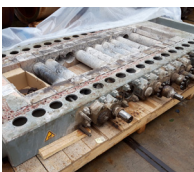
Overhaul of a roller screen